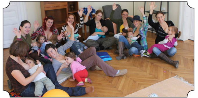
Romania, Breastfeeding Challenge 2013