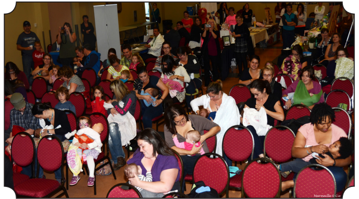
Repentigny, Quebec 2013