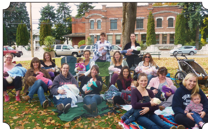
Grand Forks, Breastfeeding Challenge 2013!

Please feel free to share the newsletter and encourage colleagues and friends to sign up for the newsletter by emailing us at info@babyfriendly.ca and "like" us on Facebook! Find us at www.babyfriendly.ca