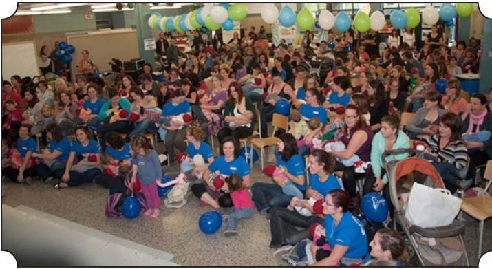
St-jean-sur-Richilieu, Quebec, 2013 Breastfeeding Challenge!