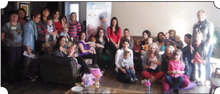
St. Quentin, New Brunswick breastfeeds!