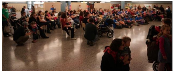
St Jean-sur-Richilieu Quebec Canada breastfeeds!