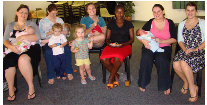
Westville KwaZulu Natal, South Africa breastfeeds!