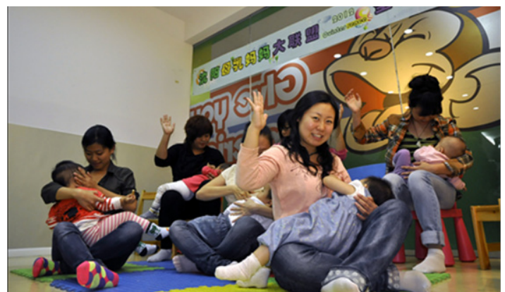
Sichuan China breastfeeds