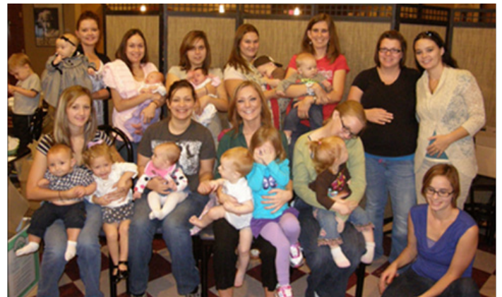
Quintessence Challenge in St Francois County Missouri