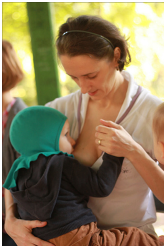
Quintessence Challenge in Bucharest Romania

In many communities around North America and other parts of the world public breastfeeding is still a major hurdle for many women. It seems strange that in the 21st century there is still such a prudish attitude by many towards a child breastfeeding. Breasts are fine to display to sell products or show off cleavage but demonstrating function is not accepted by some people. Times are changing but not fast enough for women to all feel supported in their communities to breastfeed their children whenever and wherever they wish. Hopefully, these winds of change will continue to blow!