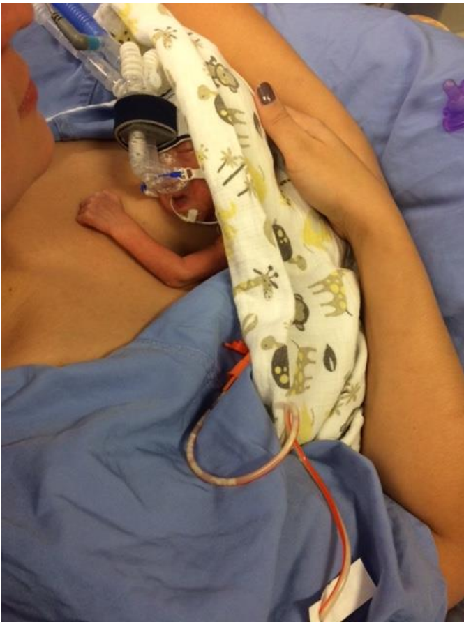
Mom and Baby from Quintessence Breastfeeding Challenge 2016 at BC Women's NICU