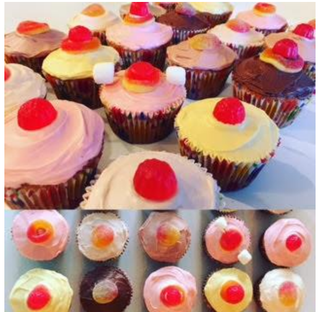
Cupcakes for the 2017 Challenge, St Paul's Hospital, Vancouver, BC