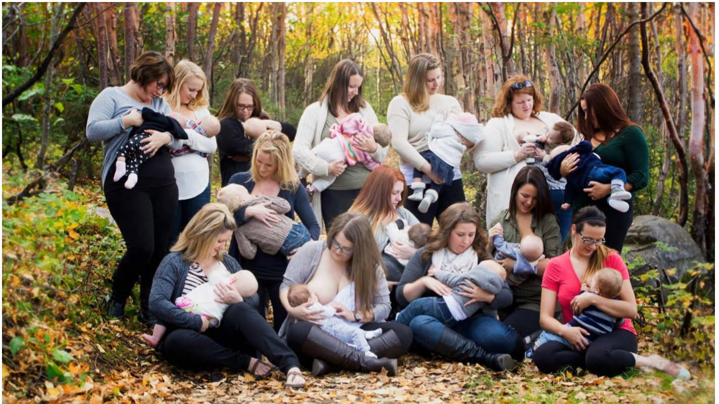
Labrador City in Newfoundland & Labrador participated in the 2017 Quintessence Breastfeeding Challenge.