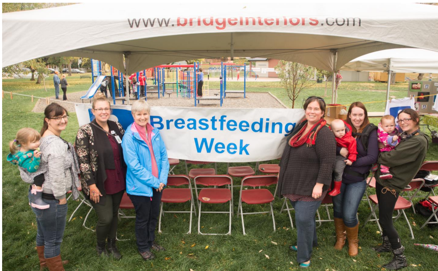
Cranbrook BC celebrated World Breastfeeding Week 2016 by participating in the Quintessence Breastfeeding Challenge.