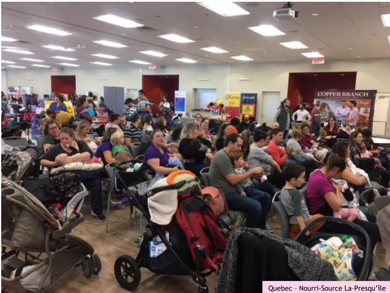
Quebec - Nourri-Source La-Presqu'île

In North American culture, “wisdom of elders” takes the form of medical knowledge, practice, and advice. Modern medicine has much to offer; it protects and saves lives. The knowledge and research and the providers who offer it can be empowering and can help to support and enable breastfeeding. However, medicine and North American culture do not have all the answers, or even ask all the right questions. It is one culture, one set of tools, among many available to you.