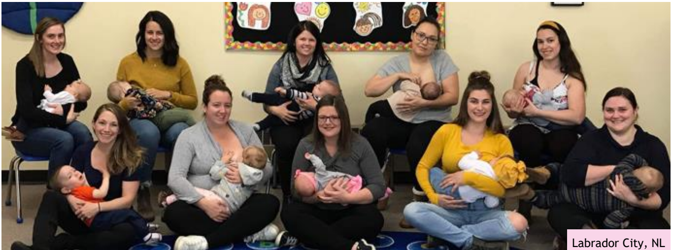
Labrador City, NL