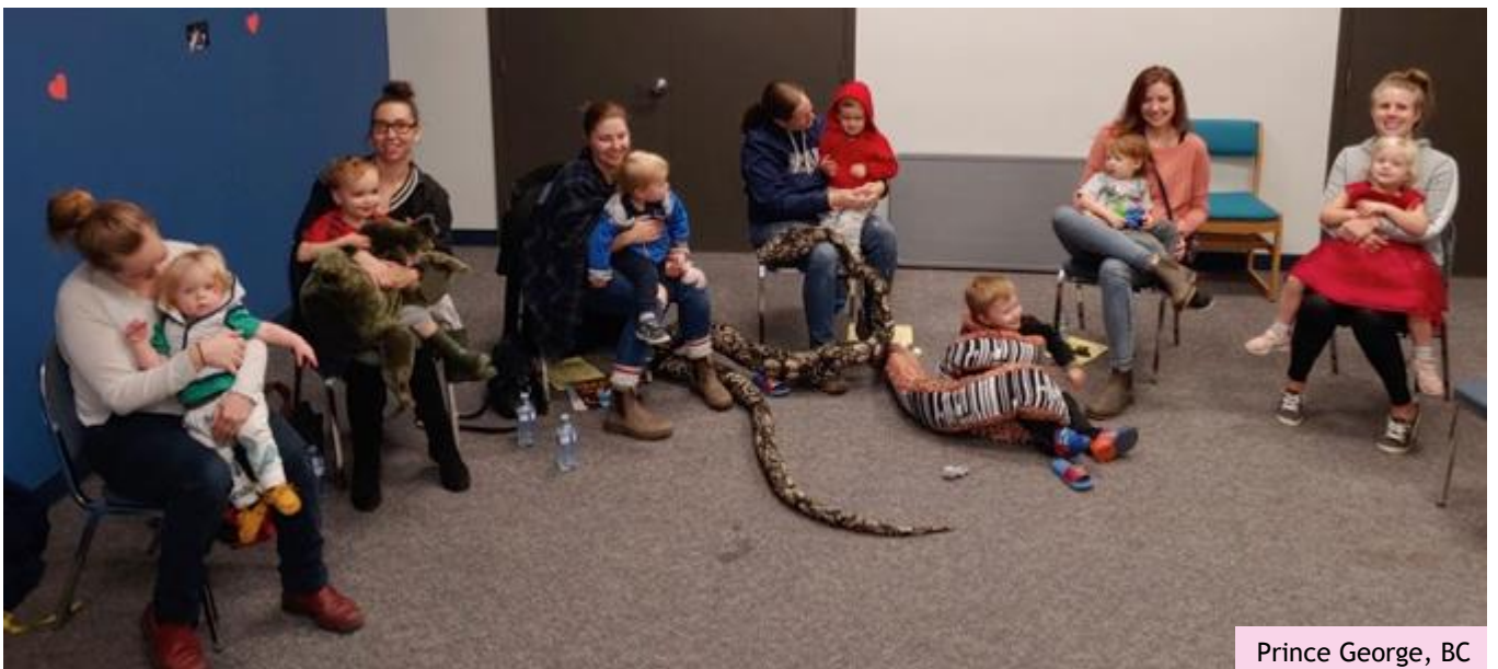
Prince George, BC