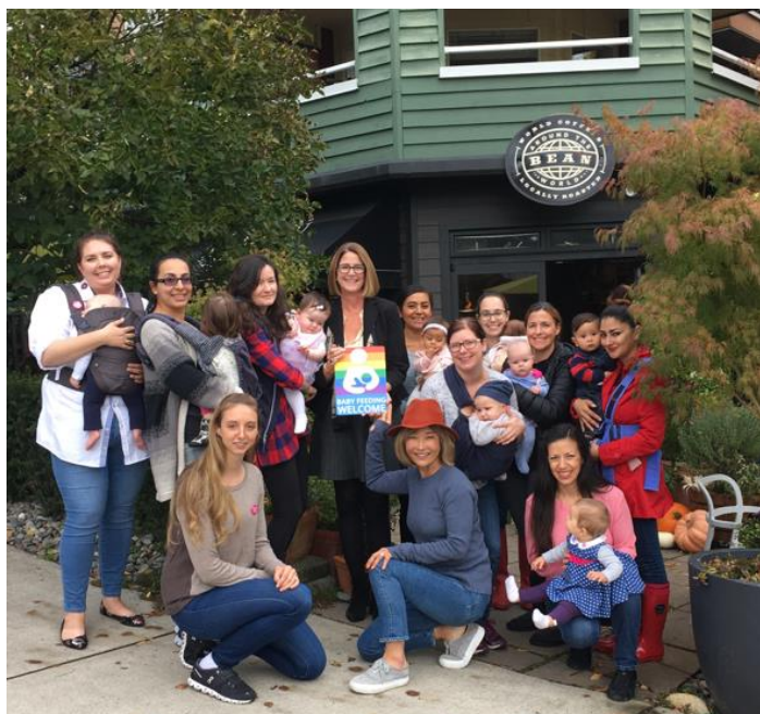
Quayside Bean Around the World North Vancouver, BC