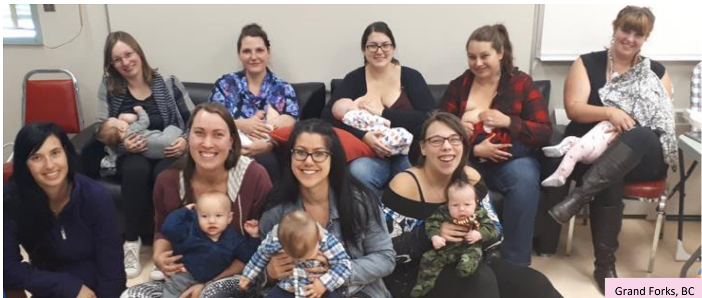
Grand Forks, BC