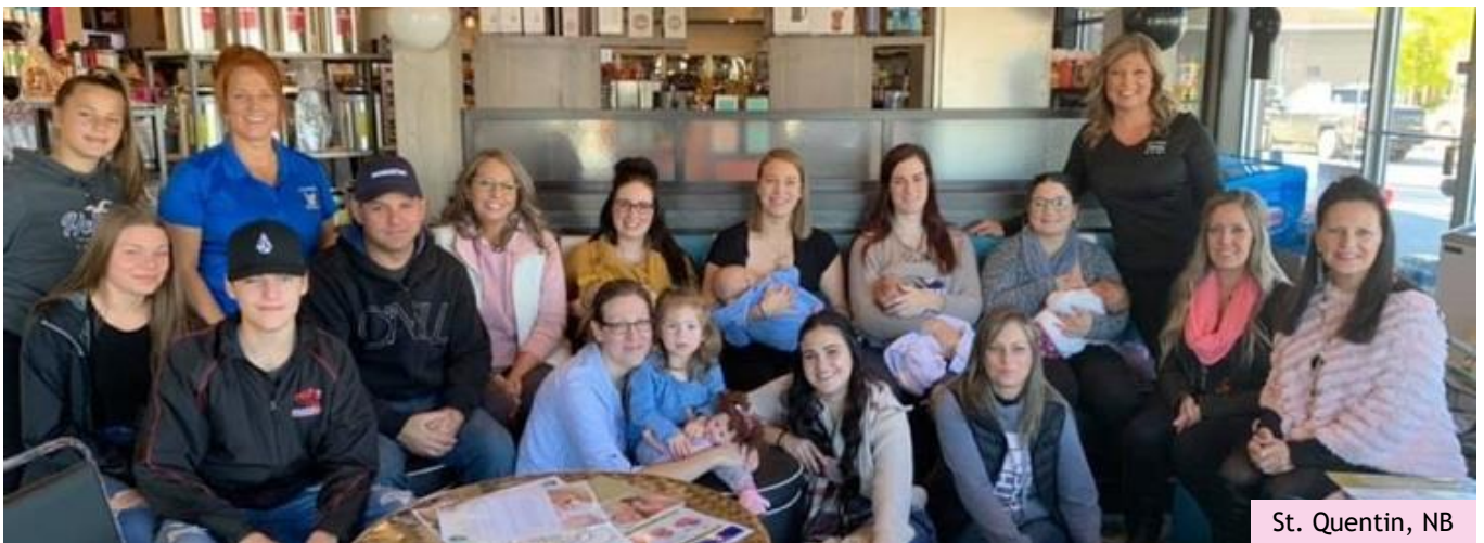
St. Quentin, NB