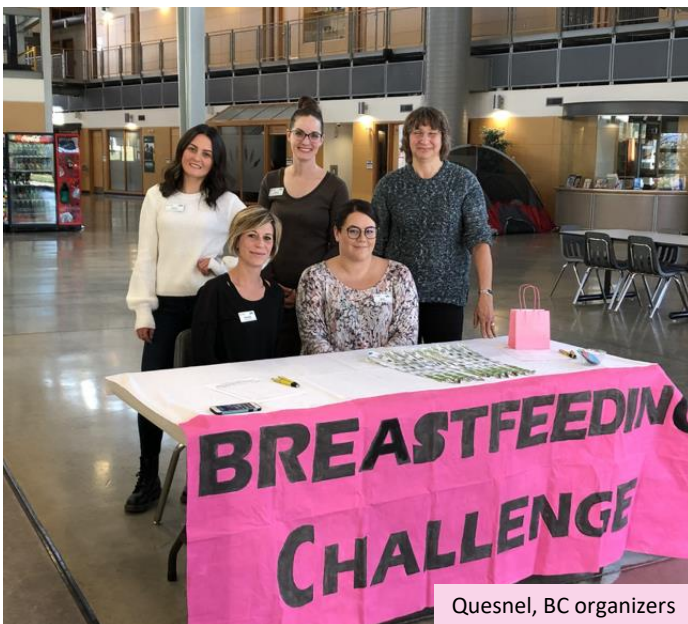
Quesnel, BC organizers