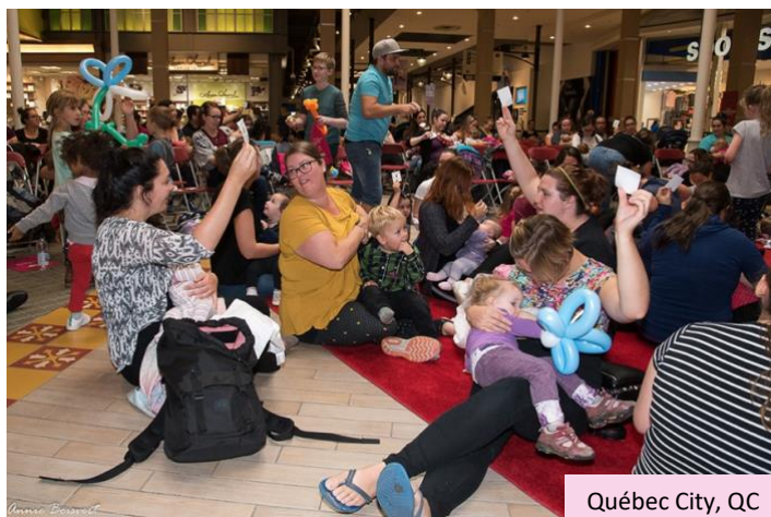
Québec City, QC