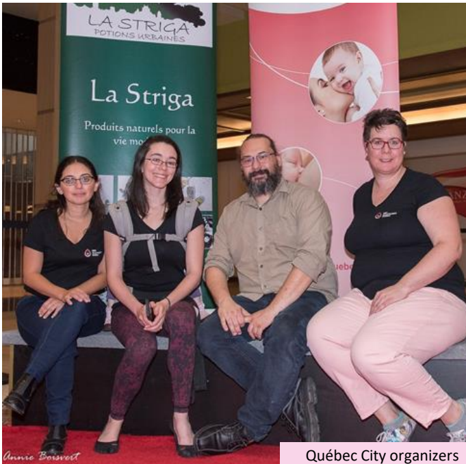
Québec City organizers

Congratulations to all the sites and their organizers who took part in the 2019 Quintessence Breastfeeding Challenge. Many of you have taken this task on over a number of years & we appreciate your efforts. We are still struggling with our website and are making slow progress. If you neglected to submit your results, please send us your numbers and we will add them to our totals.